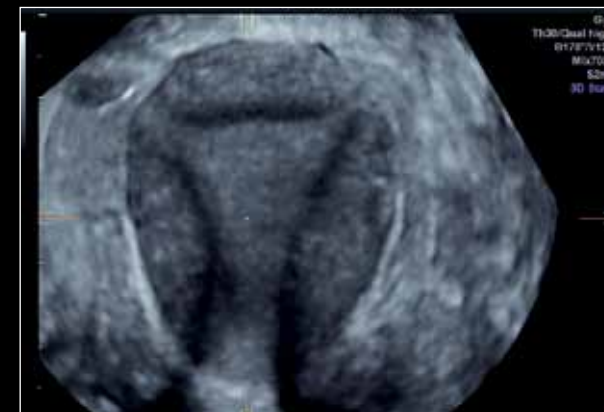
Uterus frontal view shown in 3D using the RIC5-9W-RS probe.