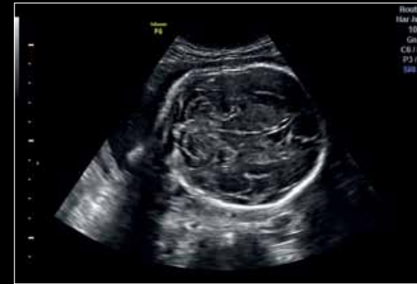
2D view of fetal brain using the RAB2-5-RS probe.