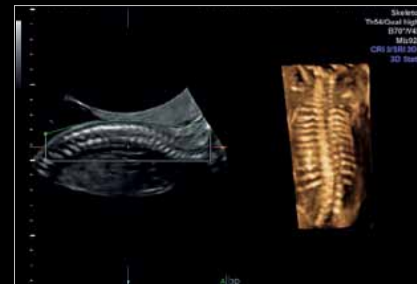
3D fetal spine for enhanced clinical confidence using the RAB2-5-RS probe.