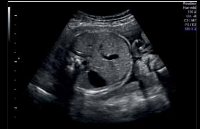
2D view of fetal abdomen using the RAB2-5-RS probe.