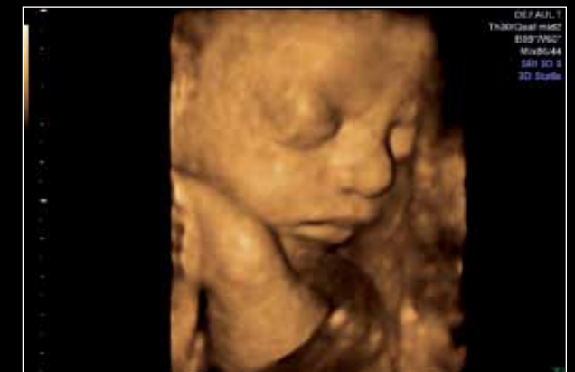
3D fetal face for enhanced clinical confidence using the RAB2-5-RS probe.