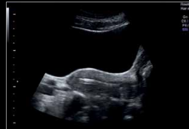
2D view of uterus using the 4C-RS probe.