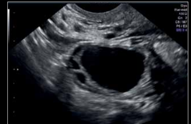
2D image of a cyst using RIC5-9W-RS and wide sector.